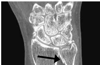
A female patient her mid-40s presented with wrist pain. The CT showed a free edge tear along the radial attachment.

The treating physician injected 1cc of iodine contrast mixed with 3cc of steroid and 0.5cc of lidocaine. The injection approach was directly into the mid carpal space. The physician used fluoroscopy to guide the needle correctly. After injection of the contrast, the technologist instructed the patient to flex her wrist back and forth, and then performed a CT exam of her wrist. The patient was positioned in a normal seated position and placed her wrist inside the InReach bore. The scan was performed in 25 seconds. No recovery time was required after scanning.